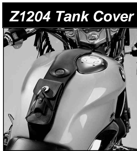
Z1204 Tank Cover