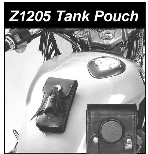
Z1205 Tank Pouch