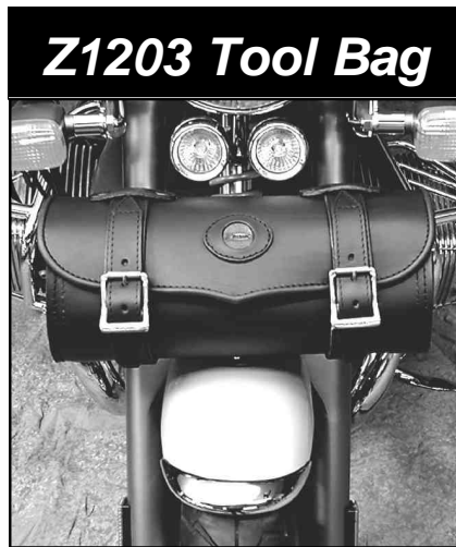
Z1203 Tool Bag

Your kit includes one of the following items: Z1203, Z1204 or Z1205 No hardware required.